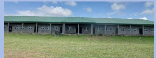
The original school (left) and nearly complete new building (above).