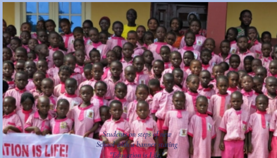
Students on steps of new School building waiting for school to begin