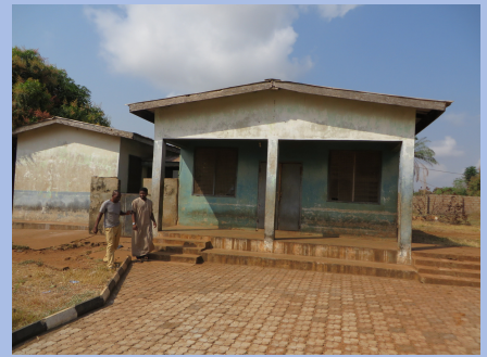
The current St. Kizito kitchen